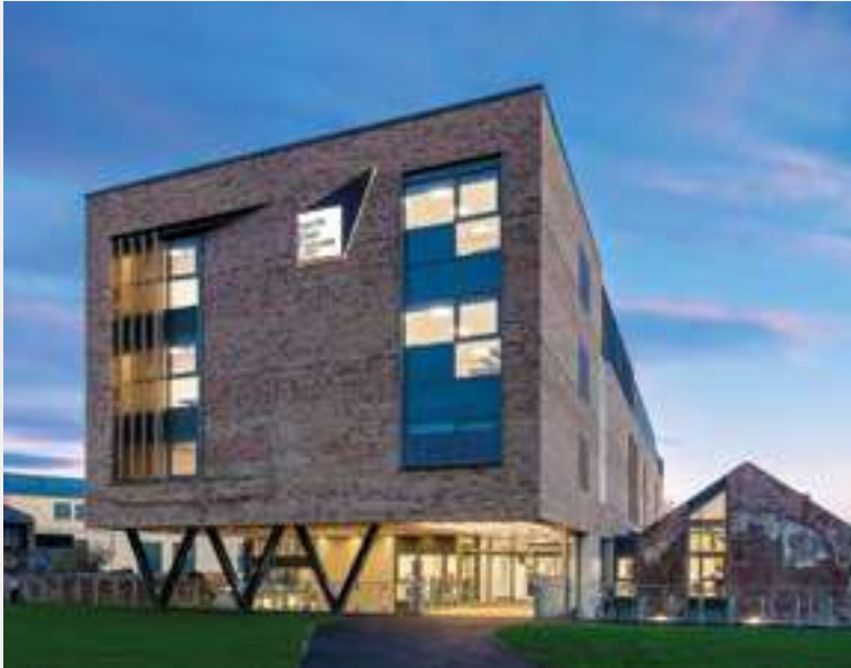
North East Futures is located in Stephenson Square, next to Newcastle Central train station and Metro stop

“ “My daughter started in year 10 and has stayed on to 6th Form. This is the best decision we have made, we’ve never looked back. ”