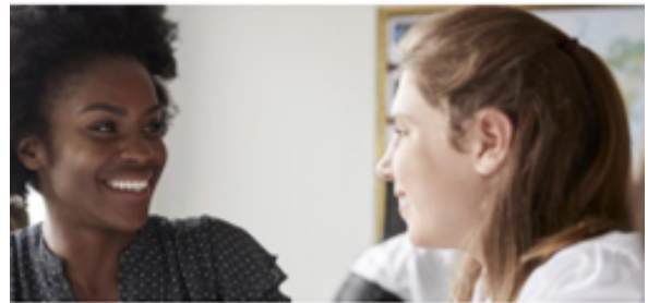
Image description: woman and young person smile at each other in a classroom setting